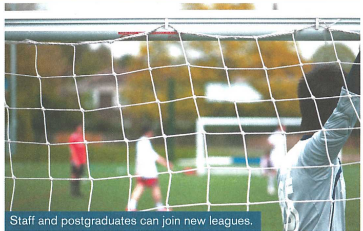
Staff and postgraduates can join new leagues.